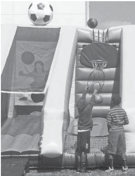
Kids enjoy shooting hoops at one of the several games available during the Hispanic Heritage Festival celebrated at Crozier Middle School in the City of Inglewood. The event included vendors, information booths about city services, food, music and face painting.