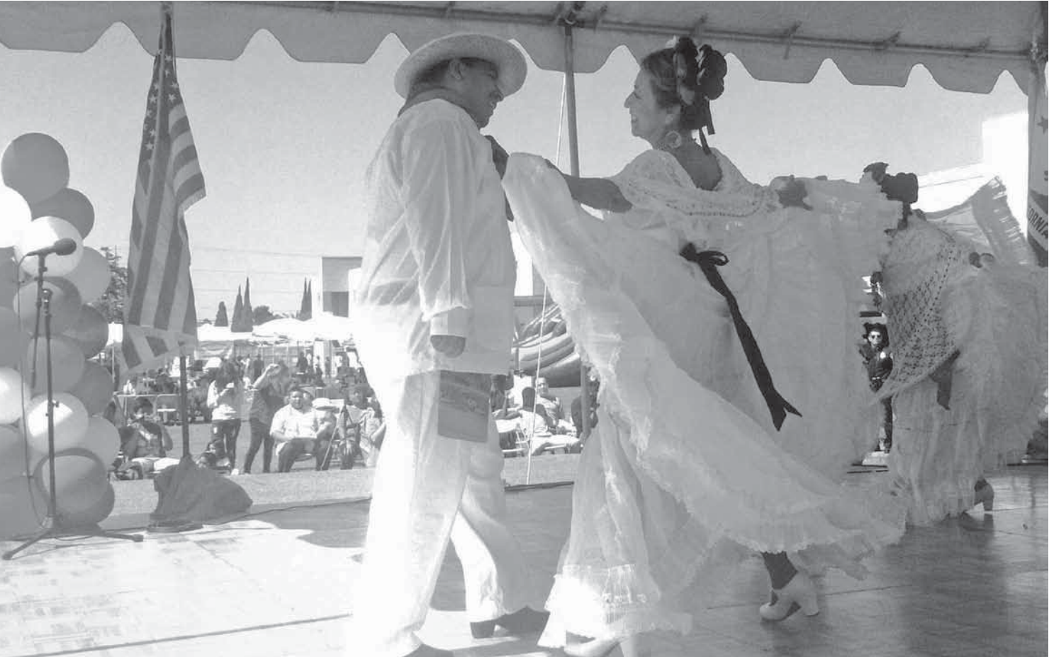
Dancers from Grupo Ballet Folklorico Macias, a dance group from Inglewood, perform for spectators during the weekend's Hispanic Heritage Festival. The dance group has been a part of the community for more than 20 years.